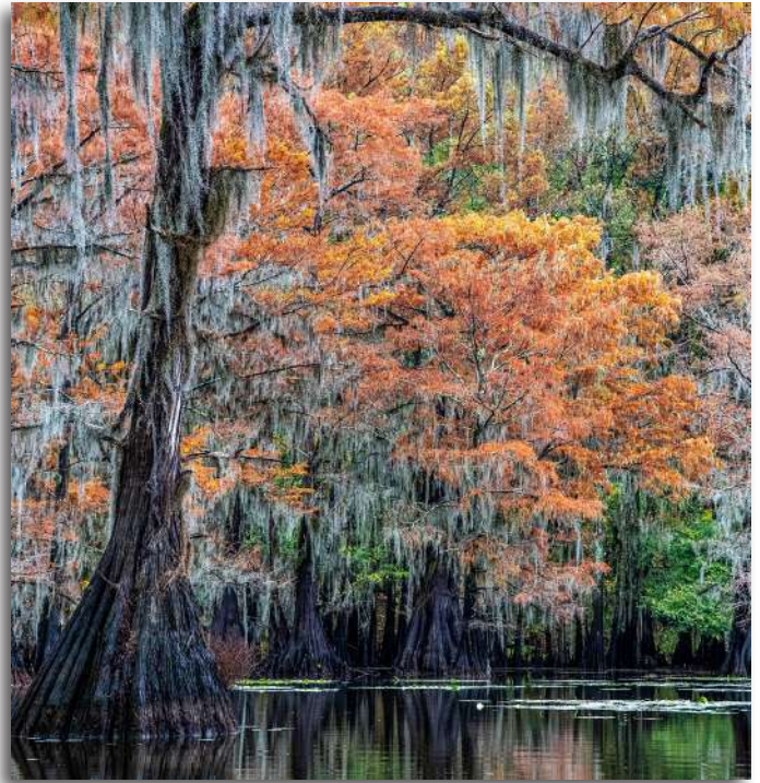
2 nd "Cypress Trees, Caddo Lake, Texas" Bill Shewchuk