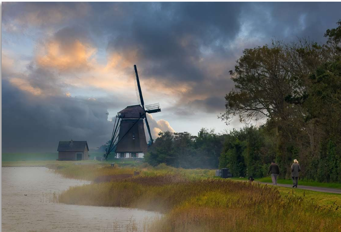
Evening Stroll, Netherlands by Julie Chen 1st Place Group Blue - September Travel