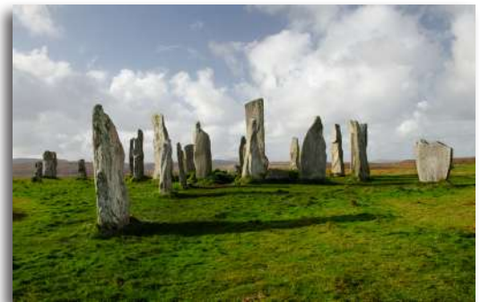
"Callanish Stones Scotland"