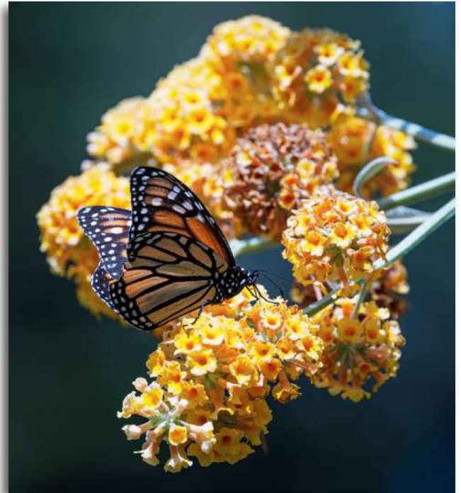
2 nd "Monarch ( Danaus plexippus )" Sara A Courtneidge