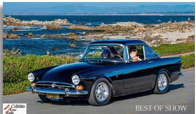
1966 Sunbeam Tiger Mark 1a

As I pulled away after a long day of appreciating and photographing the cars, and the love of those cars, I felt closer to my dad. I thought that, maybe, I might be a little bit of a “car guy,” after all.