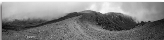
HM "Hiking Into the Storm" Joni Zabala