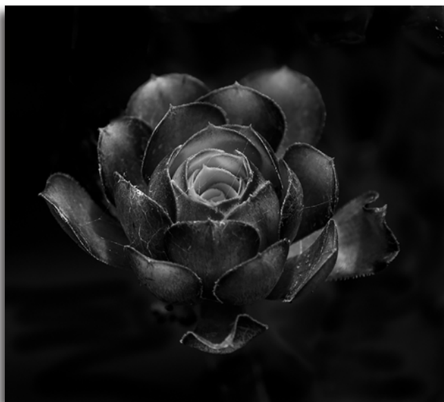
1 st "Beauty in Agings" Carol Fuessenich (Group Green)