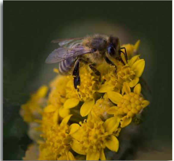
HM "Honey Bee on Flower" Jared Ikeda