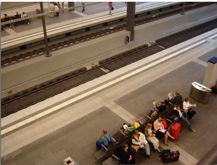
3 rd "Waiting for the Train" Brian Spiegel

Note: No Honorable Mentions were awarded in this group.