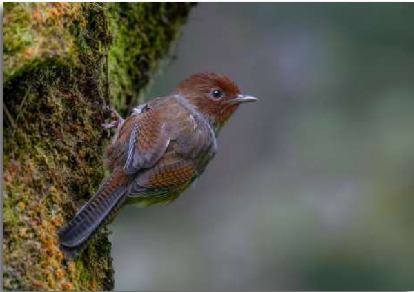
2 nd "Taiwan Barwing" Julie Chen