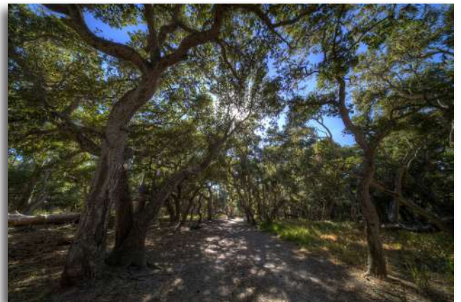
HM "Light Shadow Guide The Way" Brian Spiegel