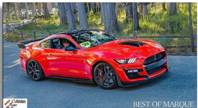
Ford Shelby GT 500 Carbon Fiber Track 2020