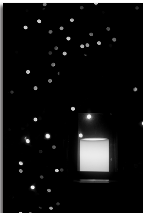
2 nd "Lights and the Night" Carol Fuessenich (Group Green)