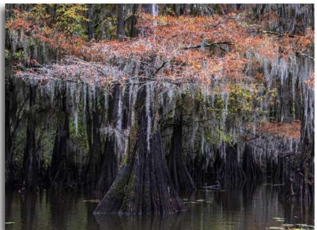
HM "Cypress Tree, Caddo Lake Texas" Bill Shewchuk