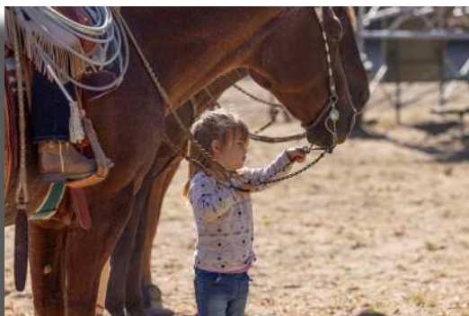
Future Cowgirl