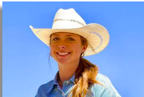
A Sunny Smile