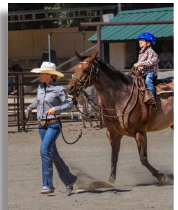
Ride 'em Cowboy