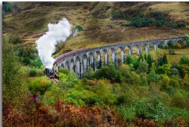
3 rd "Jacobite Train aka Hogwarts Express" Jared Ikeda