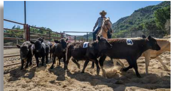
Sorting