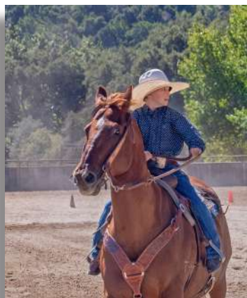
A Winning Time