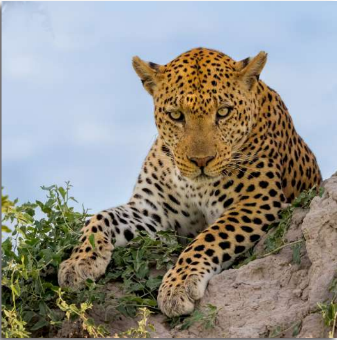
1 st "Leopard ( Panthera pardus )" Sara A Courtneidge