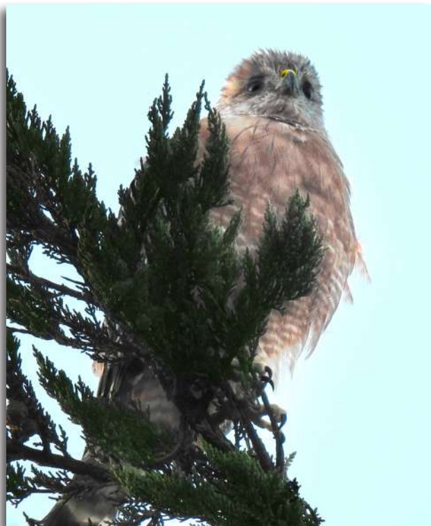
3 rd "Juvenile Red Tail Hawk" Clarissa Conn