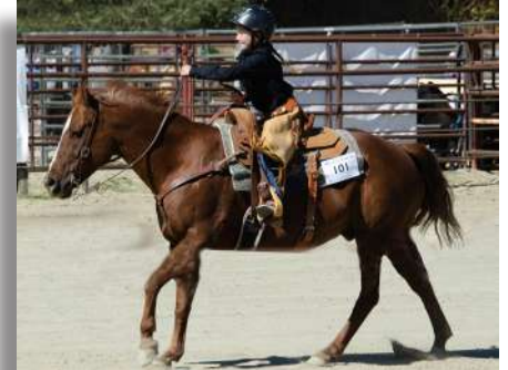
Championship Form