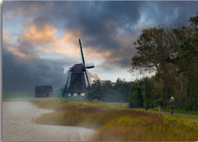
1 st "Evening Stroll, Netherlands" Julie Chen