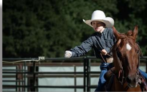
The One That Got Away