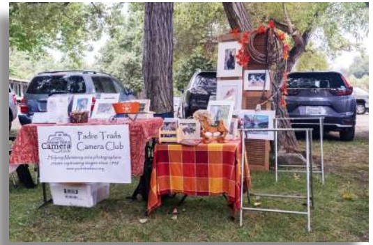
Our Mini-Booth